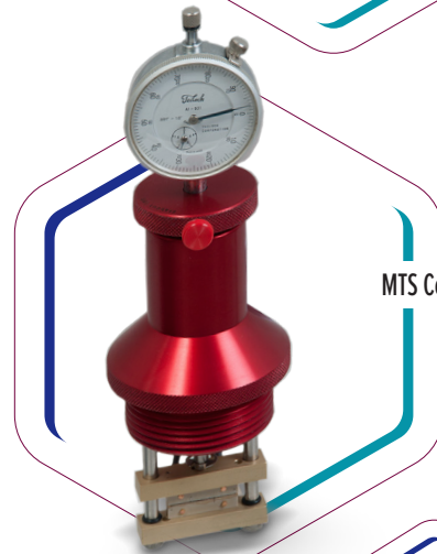
MTS Cell Head