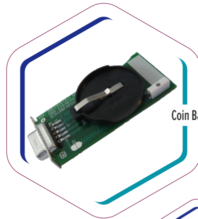
Coin Battery Holder