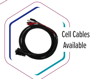
Cell Cables Available